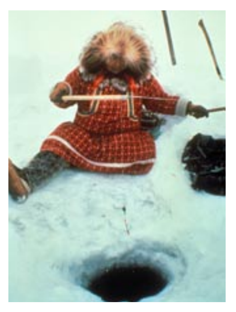
Local residents still fish for burbot, herring, sheefish and other whitefish using traditional methods.

Fish swim in rivers, lakes and streams The refuge's many rivers, sloughs and lakes support both freshwater and anadromous fisheries, and provide spawning grounds for sheefish, whitefish, northern pike, burbot, and arctic grayling. Chum salmon and Dolly Varden also spawn within refuge boundaries, while herring spawn in the coastal waters of Kotzebue Sound, adjacent to the refuge. Twenty-seven species of fish have been found within Selawik Refuge or in nearby waters.