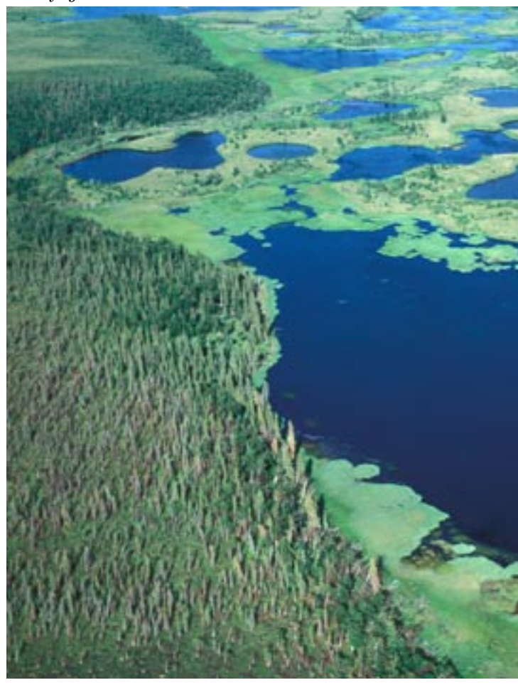
Wetlands extend for miles across the refuge.

Water is prevalent in the landscape The refuge is named for the Selawik River, which meanders through the heart of the refuge, creating a succession of rich habitats. The upper 155-mile reach of Selawik River-which is entirely within the refuge boundary-has been designated by Congress as a National Wild River. The huge wetlands complex associated with the lower Selawik River watershed is the only arctic tundra wetland complex of its size within the National Wildlife Refuge System. The numerous channels of the Kobuk River delta and the tidal waters of Hotham Inlet form the western boundary of the refuge.