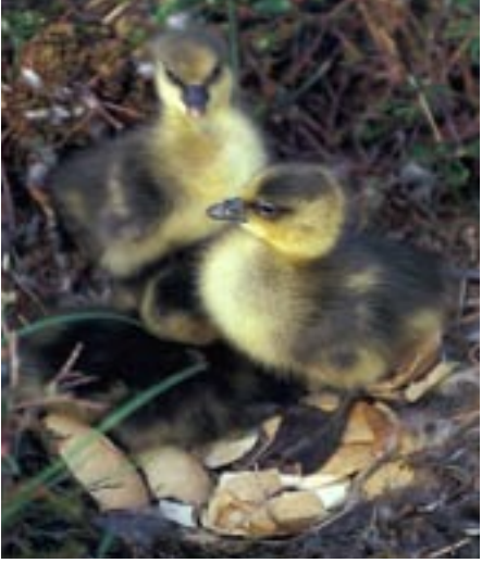
Greater whitefronted goslings are a sign that spring has returned to the arctic.

are found along major river systems within the refuge. Large numbers of geese, including greater whitefronted and lesser Canada geese use the refuge in spring, summer and fall for staging and nesting. Tundra swans also nest in large numbers