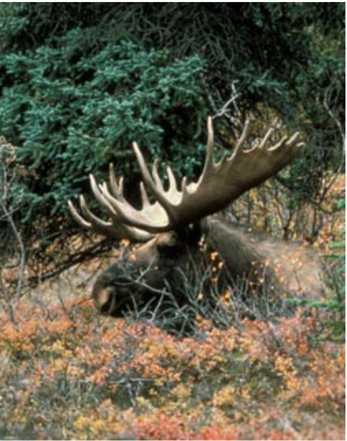
A bull moose rests in dense vegetation.

Lightning-caused wildland fires help create a mosaic of habitats in the boreal forest. Grasses, herbs, flowers and deciduous trees grow where fire has removed mature spruce and mosses. Then small mammals—and their predators—thrive.