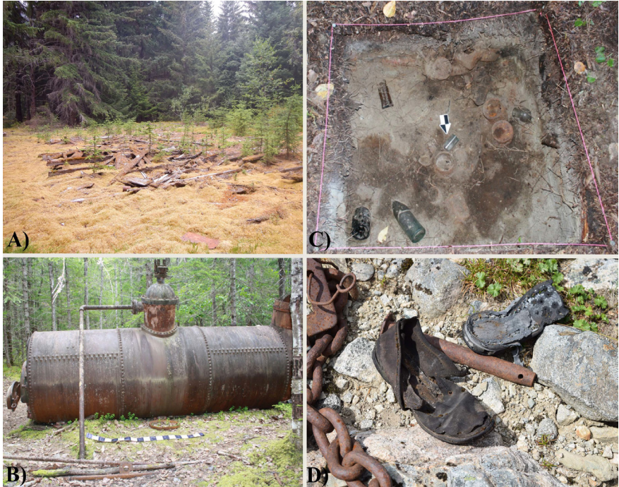
Fig. 2. Gold Rush archaeological resources in the Chilkoot Trail Unit. A) Wood remains of structures along the historic Dyea interpretative trail. B) Steam boiler along the interpretative loop trail at Canyon City. C) Glass, ceramic and metal artefacts in excavations at the Kinney Bridge Complex. D) Leather shoes and metal artefacts abandoned near the Scales (NPS photographs).

Mountains through 24km of coastal rainforest and then two kilometres of Alpine environment. The US land management area terminates at Chilkoot Pass (elevation at 1067m). The remaining 27km of the Chilkoot Trail transverses boreal forest that is maintained in British Columbia by Parks Canada (Bernatz et al. 2011; Ferreira 2010).