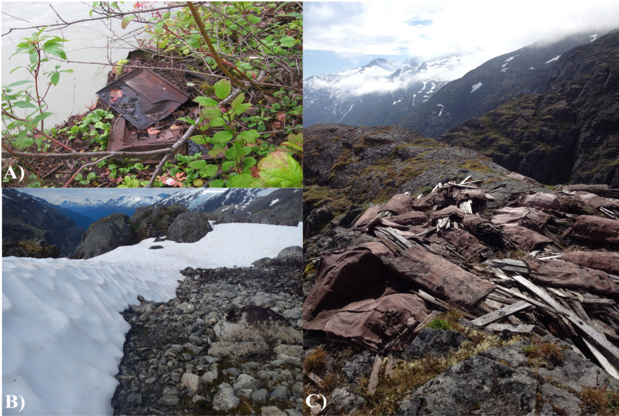
Fig. 3. Three of the four climate change threats to archaeological resources at KLGO. A) This Gold Rush-era stove was discovered eroding into the Taiya River in 2011 and is an example of the threat of fluvial channel instability to archaeological resources. B) One of the twelve ice patches examined near the Chilkoot Pass in 2016 Ice Patch Survey, melting ice patches have revealed new Gold Rush sites and possible one new pre-Gold Rush site. C) An example of organic Gold Rush artefacts that have been well preserved in the cold conditions of the high alpine environment near the Chilkoot Pass.

or detrimental to natural resource management; additionally, relocation of resources was not considered as an adaptation option because it does not align with KLGO's long-term management strategies. The remaining adaptation options—no action, monitoring, documentation and interpretation—were selected using a structured decision-making model based on inventory completeness and public accessibility of the resource, as well as the severity and time frame of the climate change threat. Prioritization of adaptation options for specific resources was determined based on overall vulnerability scores, with the most vulnerable resources given highest priority and the least vulnerable resource given lowest priority.