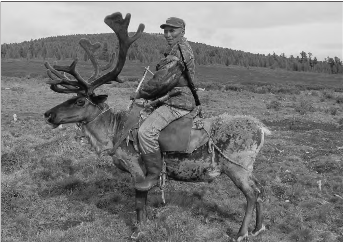
Figure 6. Sergey Kyrganay departing for hunting Siberian red deer ( Cervus elaphus ) in Aaldyg Azhyk, July 2013.

ber, summers have always been rainy in the mountainous area. However, heavy rains now seem to be more frequent. The weather in general and the winds in particular have become more humid. As a result, hunting is more challenging. The Tozhu persistently hunt for roe deer ( Capreolus capreolus ), red deer ( Cervus elaphus ), elk (i.e., moose; Alces alces ), wild boars ( Sus scrofa ), and brown bears ( Ursus arctos ) (Fig. 6). Thus, wild game is the main source of food for Tozhu reindeer herders as well as for their dogs (who are not used as shepherds but as hunting partners to track game animals). In August 2012, when I arrived at Sayzana and Andrey's aal , Sayzana's brother, Anoka, had just killed a young red deer. As Anoka told me (pers. comm. 2014), such a catch feeds a family of four people, as well as four dogs, for four to five days. Unfortunately, heavy rains prevent herders from traveling to distant areas where they could spend more time hunting. Elders such as Sergey Kyrganay consider it more challenging to lead a nomadic life today due to increased humidity. Two other research partners, who are retired and stay in the village,