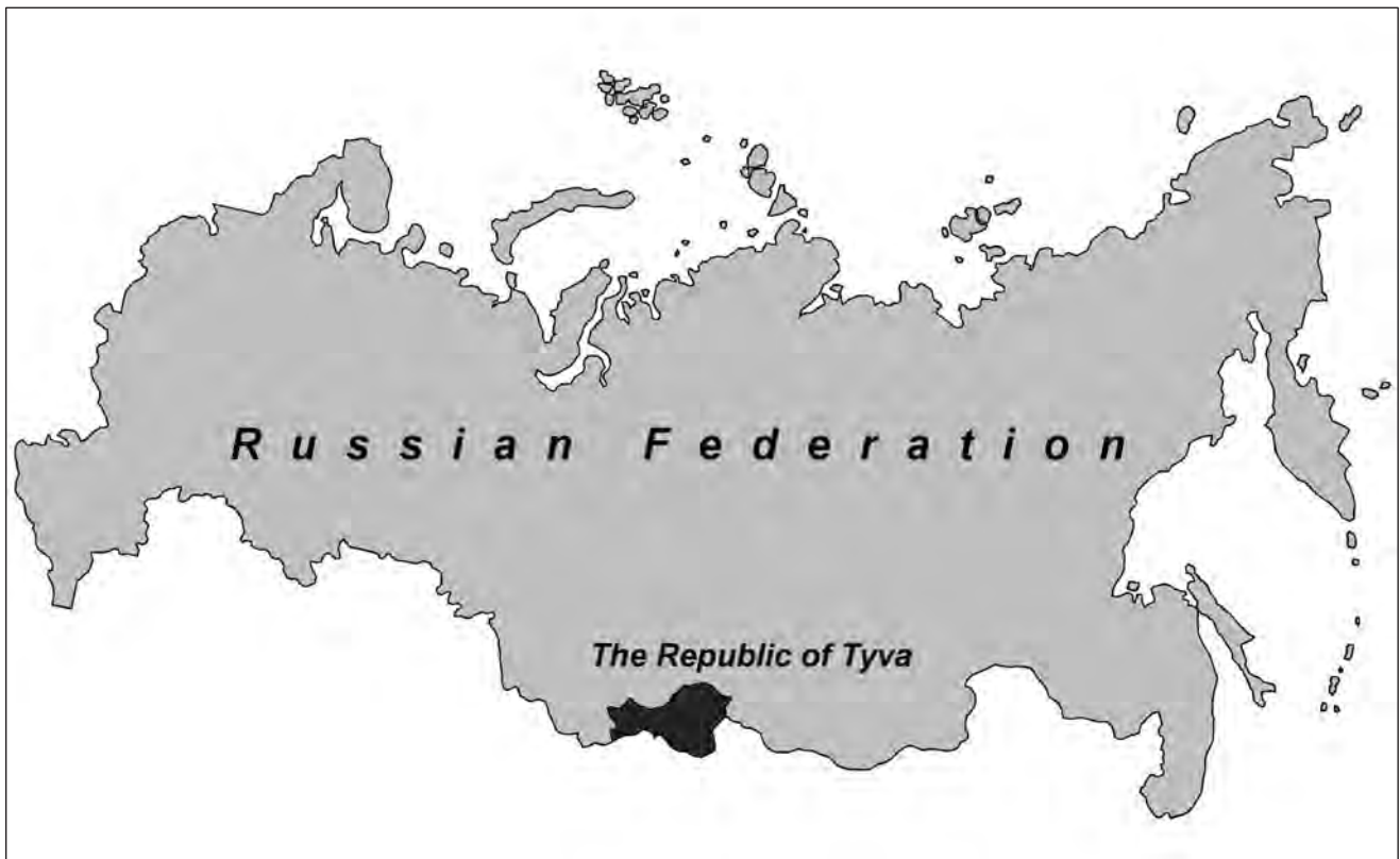
Figure 1. The Republic of Tyva in the Russian Federation.