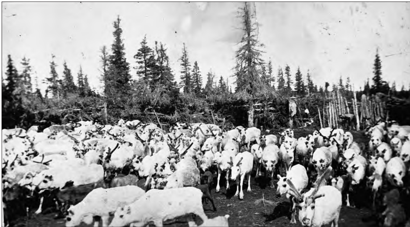
Figure 3. Reindeer in corral at Eagle Bay Reindeer Station, circa 1930.

Private reindeer herds of the Iliamna Lake region continued to increase in the early 1930s as herders spread out and ranged their deer away from the once central government stations (Fig. 3). Herders sold reindeer meat both locally and to the canneries. For example, the late Rose Hedlund (born in 1917 in Chekok on the north shore of Lake Iliamna) grew up eating reindeer. Her father purchased two reindeer each year from the Eagle Bay herd (Hedlund and Hedlund 1985). Herders also trained sled deer to transport supplies along the Kvichak River, stopping at trade stores in Igiugig, Levelock, and the Alaska Packers' Association cannery, Diamond J, near the mouth of Bristol Bay. In 1930, fifty-three reindeer were butchered out of Newhalen's 422 reindeer, and twenty-six were trained as sled deer (Unrau 1994:315). Under chief herder Simon John, the Newhalen herd reached 1,008 reindeer