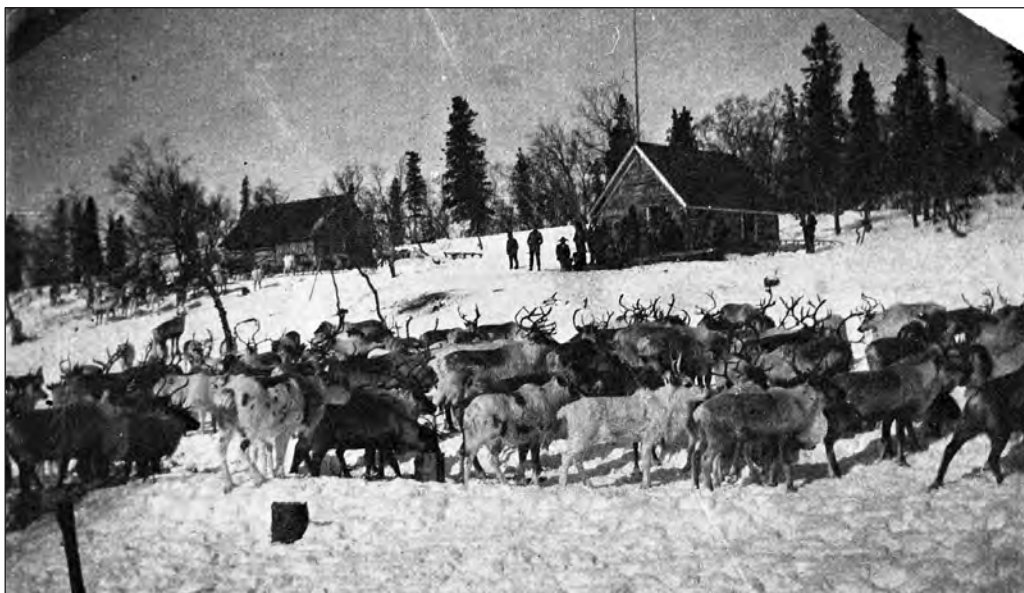
Figure 2. Kokhanok Reindeer Station, circa 1910. Courtesy of Bert and Edna Foss and the National Park Service, Museum Management Program and Katmai National Park and Preserve, cat. no. H-921.

Recognizing these initial successes, reindeer officials wanted to extend the reindeer programs in Bristol Bay. Earlier in the summer of 1908, Commissioner of Education Dr. Updegraff had traveled between Iliamna