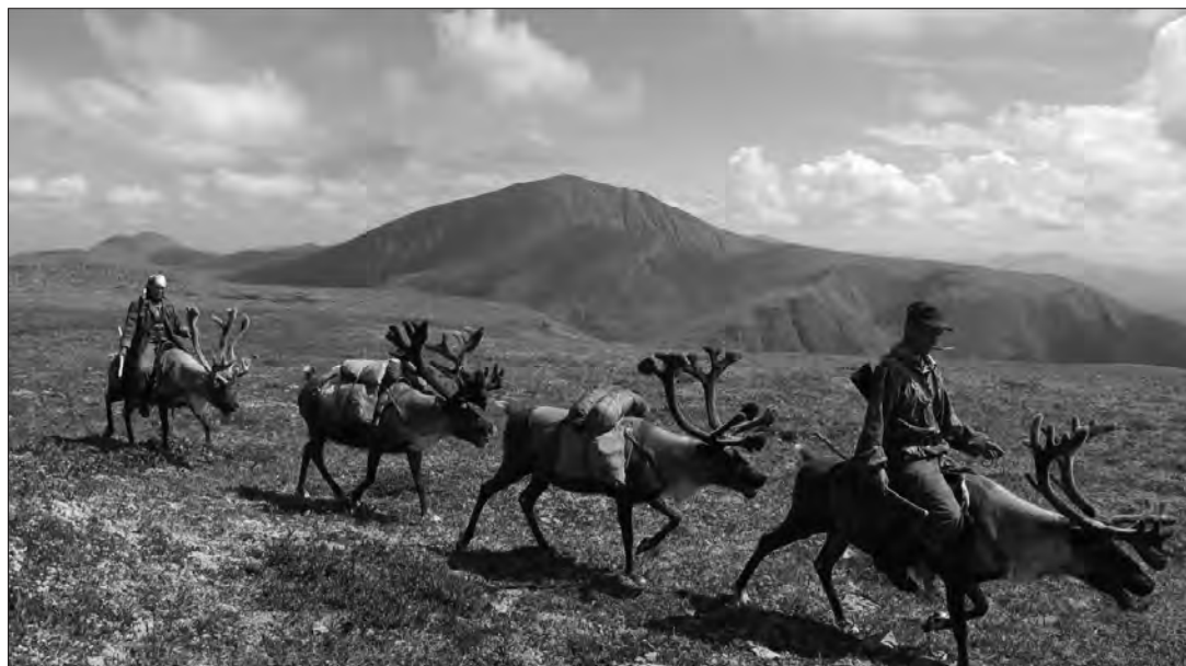
Figure 3. Riding reindeer across the Obruchev Mountains, Tozhu District, summer 2012.

Tozhu families that are involved in reindeer herding and hunting divide themselves into two geographical areas: the Serlig Khem region and Odugen taiga. The natural border between these two areas is created by the Serlig Khem River. This river is a southern spur of Bii-Khem