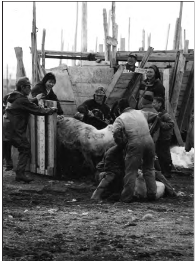
Figure 3. Ongtowasruk corral chute with crew in Wales, Alaska, 1993.