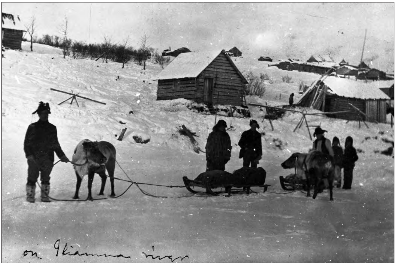
Figure 1. Reindeer apprentices from Kokhanok Reindeer Station arriving at Old Iliamna, 1909–1912. Courtesy of Jane Jacobs and the National Park Service, Museum Management Program and Katmai National Park and Preserve, cat. no. H-1853.

After graduating from their apprenticeship, some individuals remained with the government station as hired